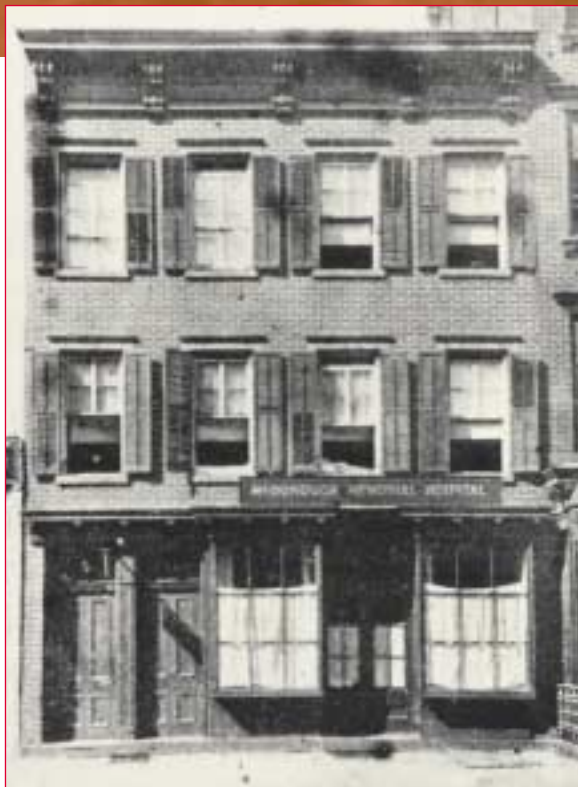
LAFAYETTE COLLEGE ARCHIVES